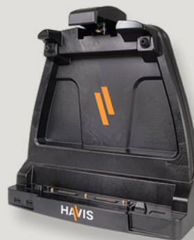
K120 TABLET DS-GTC-900 SERIES