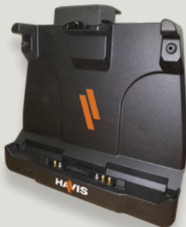
UX10 DS-GTC-1100 SERIES