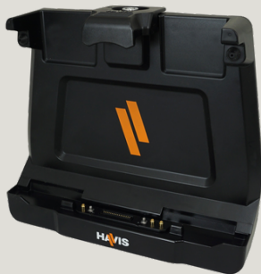
ZX10 DS-GTC-1300 SERIES