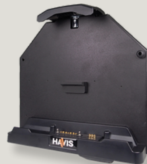
A140 DS-GTC-800 SERIES